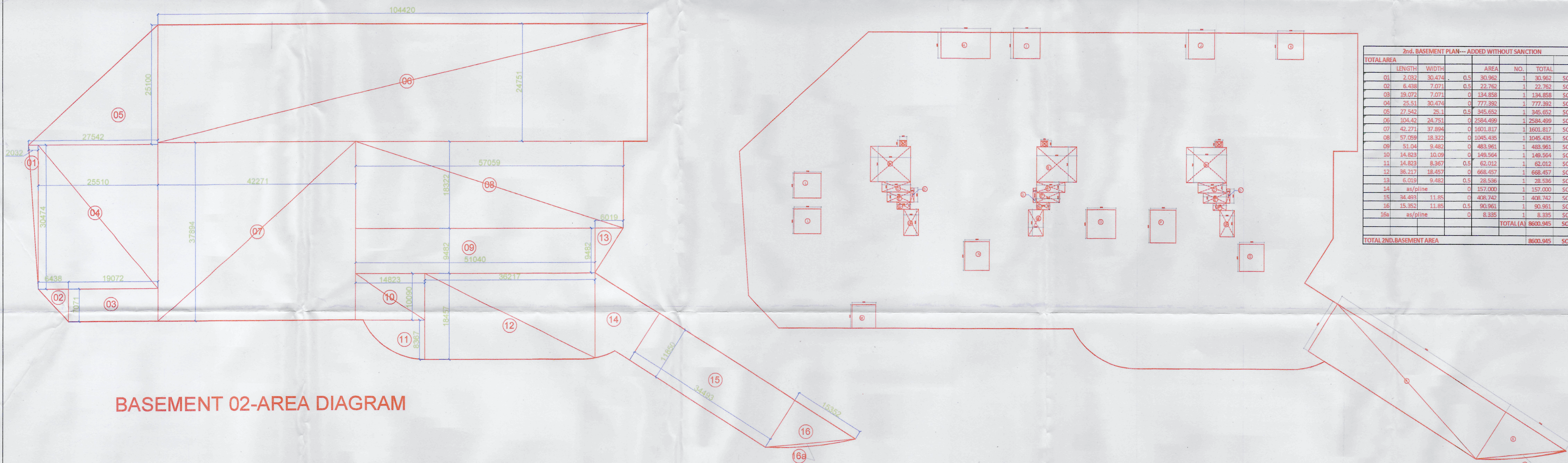
BASEMENT 02-AREA DIAGRAM